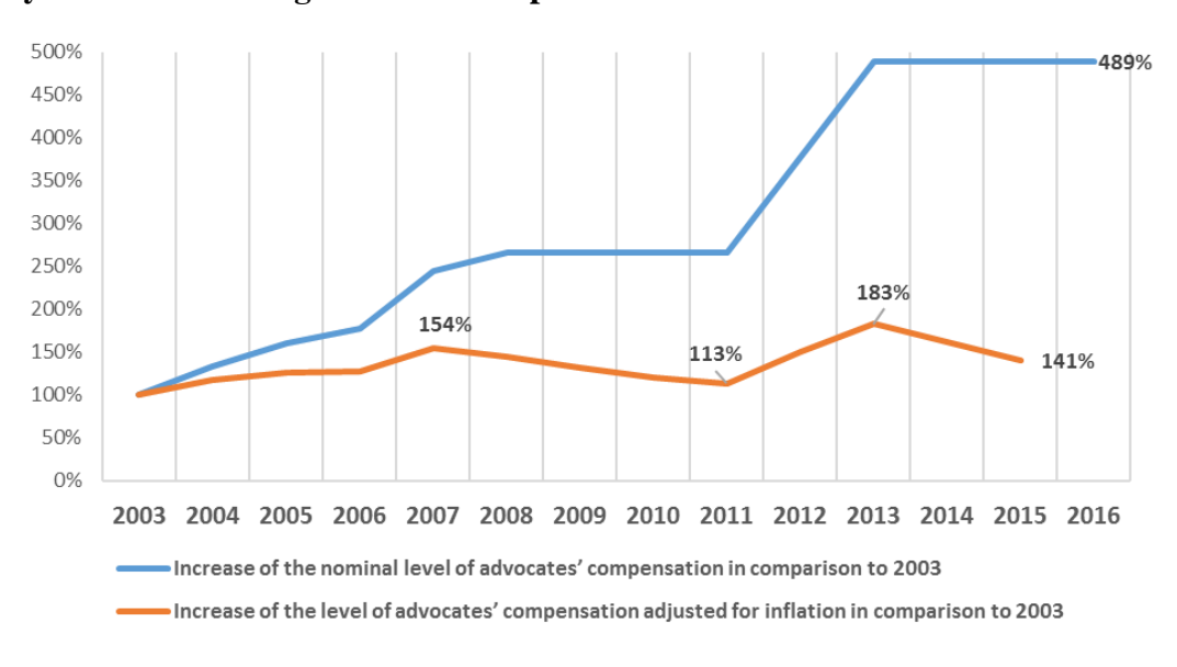
Diagram 1. Change in the nominal and real level of compensation of criminal defense lawyers' work on assignments in comparison to 2003

Apparently, the RFCL is aware of the problem and therefore addressed an official letter to the Russian Government in April 2016 requesting a considerable raise in the level of lawyer compensation for work on assignment<sup>14</sup> to 3000 rubles a day or 700 rubles per hour, arguing that the compensation of arbitration judges and prosecutors was much higher than that of criminal defense lawyers.