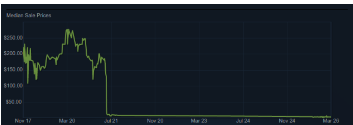
Figure 2. Example of item's price fall after duping incident

Topics Fix the bugs, Market scam, Copying the items, Comparison of Arcana items, Confusion on rarities, Bugs to be fixed reflect discussions of expectation mismatch (Musabirov et al. 2017) when the players do not get what they expected. The players can express their confusion about the items' perceived value and the price which is reflected in topics Comparison of Arcana items ("Legion Commander and PA both completely remake the model [...] But look at Crystal Maiden, whose arcana is a cape", anarchy753) and Confusion on rarities ("Not even immortals [rarity]. There are legendaries [lower rarity] that do more than immortal things", JaakxcyqobbqeLayque) or about failed game design that breaks trade by allowing Market scam ("The same seller is listing two BladeBiters for the same price, but one doesn't have the Kinetic gem, while the other has", almirantecarvalho) and Copying the items ("Iwould be mad if my Dendi signature went from 150 to 2$ overnight because of a dupe abuse", Saelkhas). Finally, players complain about visual bugs and try to explain why those emerge which is reflected in topics Fix the bugs ("using Tentacular Timelord head without Viridus Claw makes tentacles clip with default model's chest", _thoax_) and Bugs to be fixed ("The Terrorblade arcana still has a bug", xCesme).