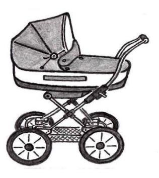
Figure 1. Object naming stimulus example

Object naming is considered to be the "gold standard" for the brain mapping procedure [Talacchi et al., 2013]. One of the classical object naming tests is The Boston Naming Test [Kaplan et al., 1983]. Object naming is discussed in detail elsewhere (see [Dragoy et al., 2016]; [Ojemann, 1979]. During the task, the patient is presented with a set of black-and-white slides with a line drawing of a common object, and they have 4 seconds to name it. Every nomination should start with the word " Eto " ("This is") for the neurolinguist to differentiate between anomia (retrieval failure) and speech arrest (inability to speak), in other words, between language and speech errors. The task consisted of 50 object pictures. Example of the stimulus: