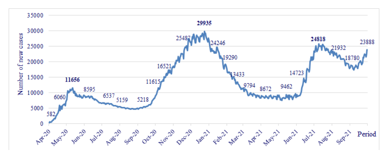
Figure 1. The number of new COVID-19 cases in Russia, April 2020–September 2021<sup>4</sup>

In this paper, we investigate the relationship between COVID-19 cases and the changes in retail bank deposits in regional banks located in Russian regions which were differently hit by the pandemic. We also examine the differences in this influence for deposits of different maturities adding to our understanding of the maturity shifts under pandemic pressure. For this purpose, we rely on the detailed financial fundamentals of all Russian regional banks and data on cross-regional variation in pandemic exposure, and regional socio-economic characteristics.