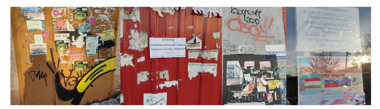
Figure 15. Unauthorised signs (Kuznetsov 2023)

Notice boards, handwritten announcements, graffiti and unauthorised signs encountered by the author in Orenburg were entirely in Russian (except for the only one in Uzbek) (Figure 15). The announcements at the market pertaining bus transfers to Central Asia, targeted primarily at labour migrants were in Russian as well (Figure 15).