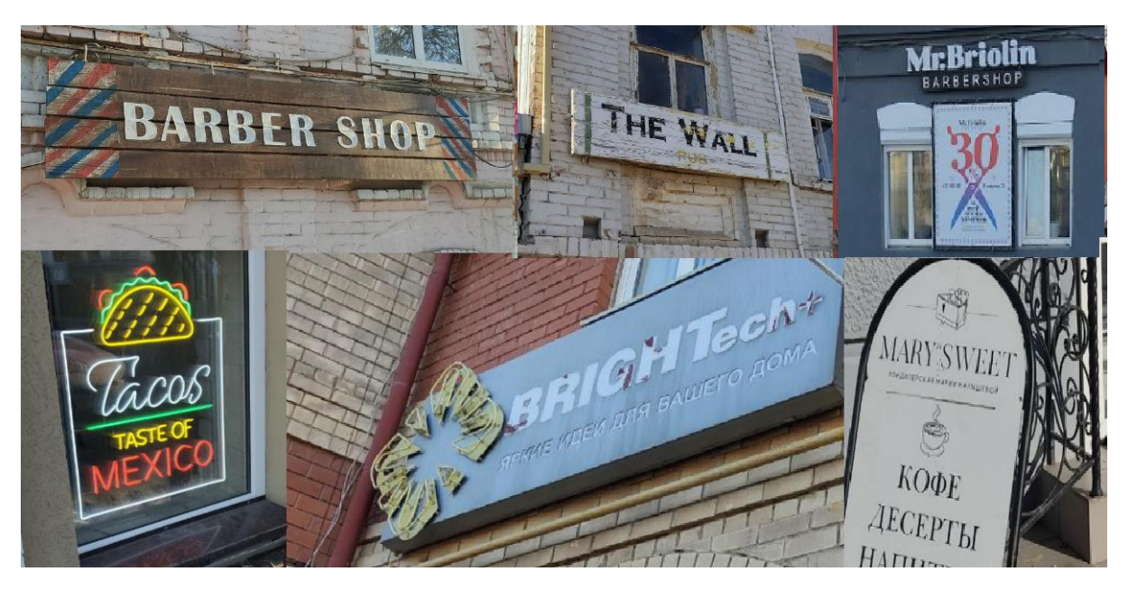
Figure 16. Symbolic use of English in LL (Kuznetsov 2023)

Only once there was a sign with an intended foreign viewer – it was a souvenir shop (Figure 17). This may be due to the city's weak tourist capacity, especially for foreign tourists.