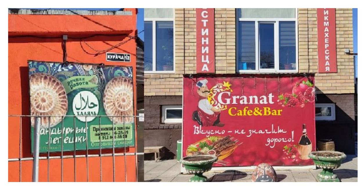
Figure 14. "Oriental" fonts on Eastern Cuisine eateries near the Suleymania mosque (Kuznetsov 2023)