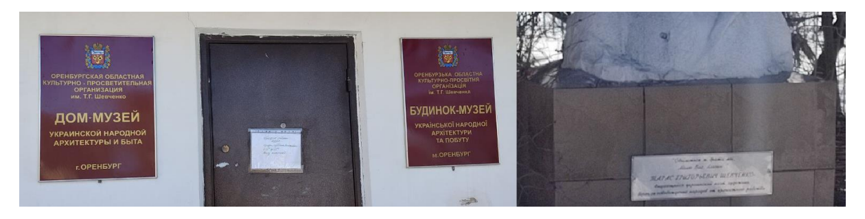
Figure 4. Ukrainian signs in the Ethnic Village (Kuznetsov 2023)

On the fence of the Mordvin yard there are two extremely faded signs. One features a flag of the Republic of Mordovia (Russia) and the Orenburg Oblast with the bilingual Russian and Erzya text ''Mordvin yard''/''Erzya-Moksha yard'' (Figure 3). Since the sign has faded to the point of being illegible, here is a photo of the same sign from 2014 (Figure 3). Here one can see that there used to be a Mordvin ornament on the sign. On the second sign on the right there is a text presumably in Erzya, but due to fading it is difficult to recognize.