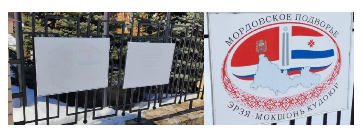
Figure 3. Mordvin signs in the Ethnic Village (Kuznetsov 2023)

On the fence of the Mordvin yard there are two extremely faded signs. One features a flag of the Republic of Mordovia (Russia) and the Orenburg Oblast with the bilingual Russian and Erzya text ''Mordvin yard''/''Erzya-Moksha yard'' (Figure 3). Since the sign has faded to the point of being illegible, here is a photo of the same sign from 2014 (Figure 3). Here one can see that there used to be a Mordvin ornament on the sign. On the second sign on the right there is a text presumably in Erzya, but due to fading it is difficult to recognize.