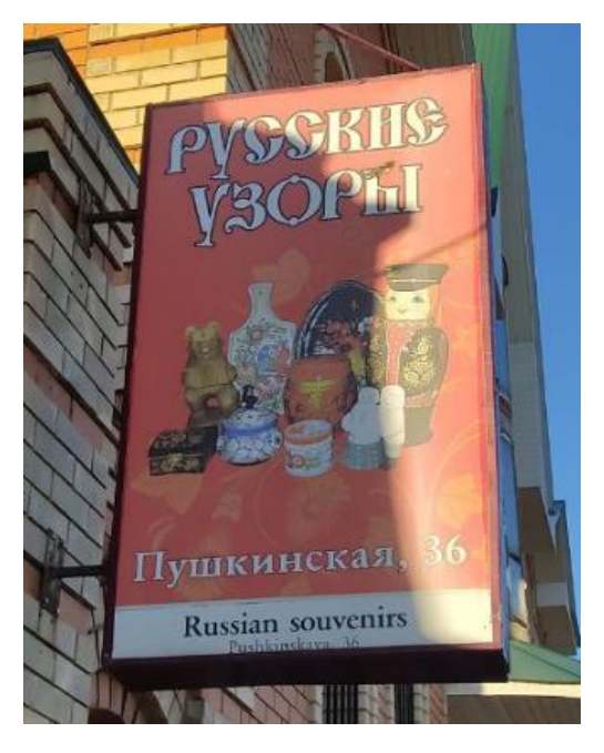
Figure 17. Souvenir shop – Instrumental use of English (Kuznetsov 2023)

Only once there was a sign with an intended foreign viewer – it was a souvenir shop (Figure 17). This may be due to the city's weak tourist capacity, especially for foreign tourists.