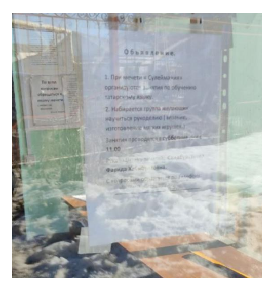
Figure 10. Tatar language classes advertisement (Kuznetsov 2023)

In another Tatar mosque, Suleymania (Сулеймания), according to the deputy imam, "the only non-Russian language thing is the Quran in Arabic". Interestingly, at the entrance there were Russian printed announcements about enrollment in Tatar language classes (Figure 10).