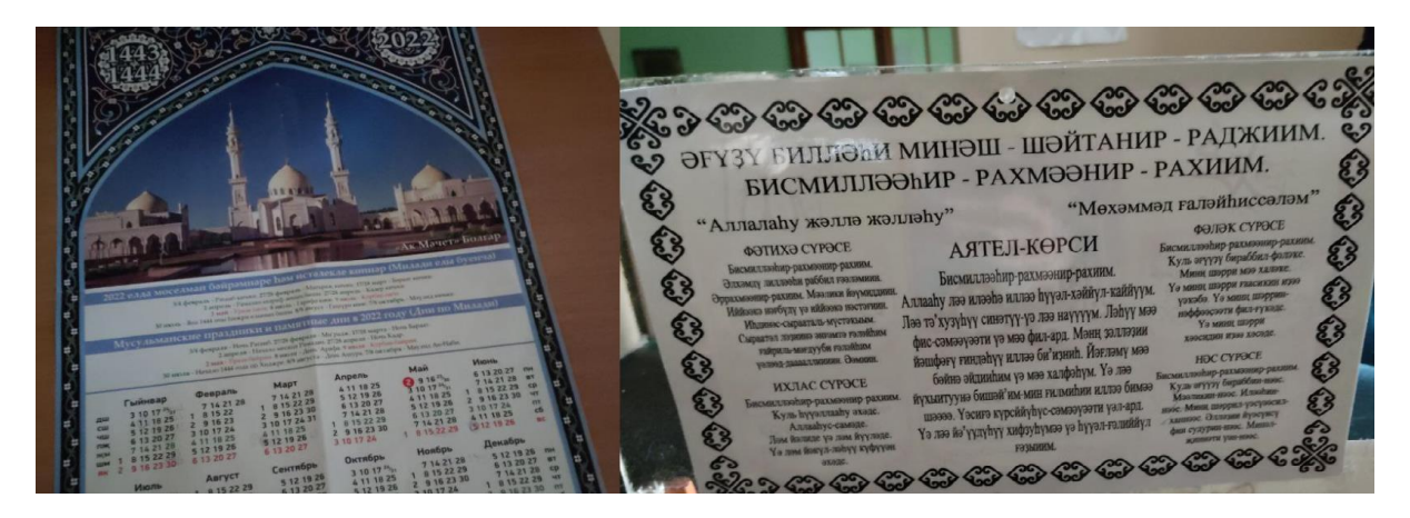
Figure 9. LL inside a Tatar mosque (Kuznetsov 2023)

In the Tatar Husainia mosque (Хусаиния) there was only a bilingual Russian-Tatar calendar (Figure 9). However, there were also printouts with Muslim prayers in Arabic, written in Cyrillic phonetic notation (Figure 9).