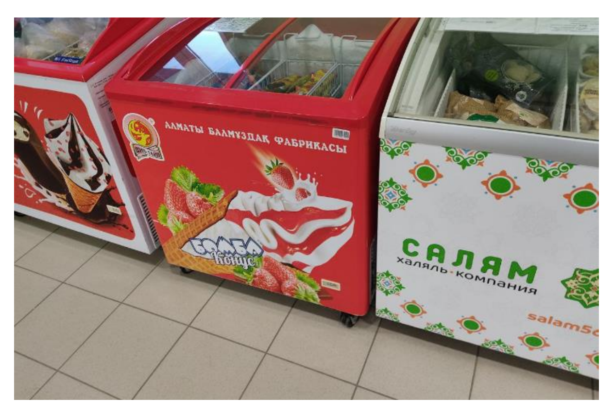
Figure 20. A refrigerator from Kazakhstan (Kuznetsov 2023)

Kazakhstan) was seen once in a halal food store (Figure 20). Two times, we saw Kazakhstani food shops.