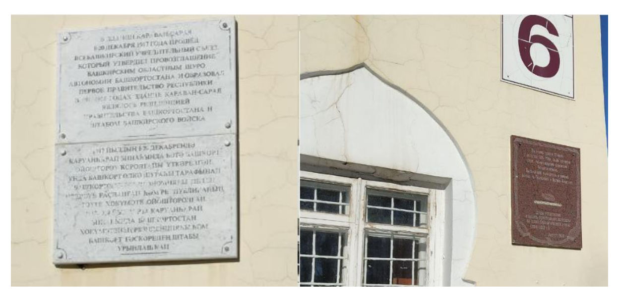
Figure 7. Signs on Caravanserai (Kuznetsov 2023)

The next place worthy of attention is the Bashkir cultural centre and prayer house "Caravanserai". Outside the building there are several signs with Russian texts dedicated to the history of the place (Figure 7). One of them is duplicated in the Bashkir language.