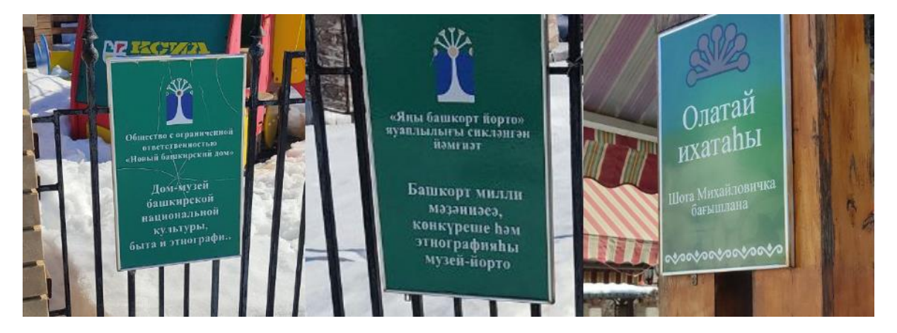
Figure 2. Bashkir signs in the Ethnic Village (Kuznetsov 2023)

On the fence of the "Tatarstan" restaurant (the name is written in an "oriental" font) there are advertisements for business lunches and Chuvash beer (in Russian), and nearby there are two signs saying "House-Museum of Tatar Culture, Way of Life and Ethnography" in Russian and Tatar (Figure 1).