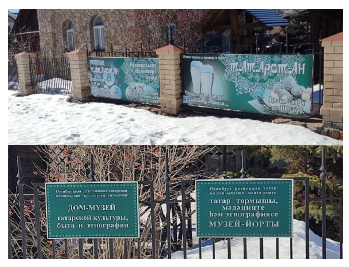
Figure 1. Tatar signs in the Ethnic Village. (Kuznetsov 2023)

On the fence of the "Tatarstan" restaurant (the name is written in an "oriental" font) there are advertisements for business lunches and Chuvash beer (in Russian), and nearby there are two signs saying "House-Museum of Tatar Culture, Way of Life and Ethnography" in Russian and Tatar (Figure 1).