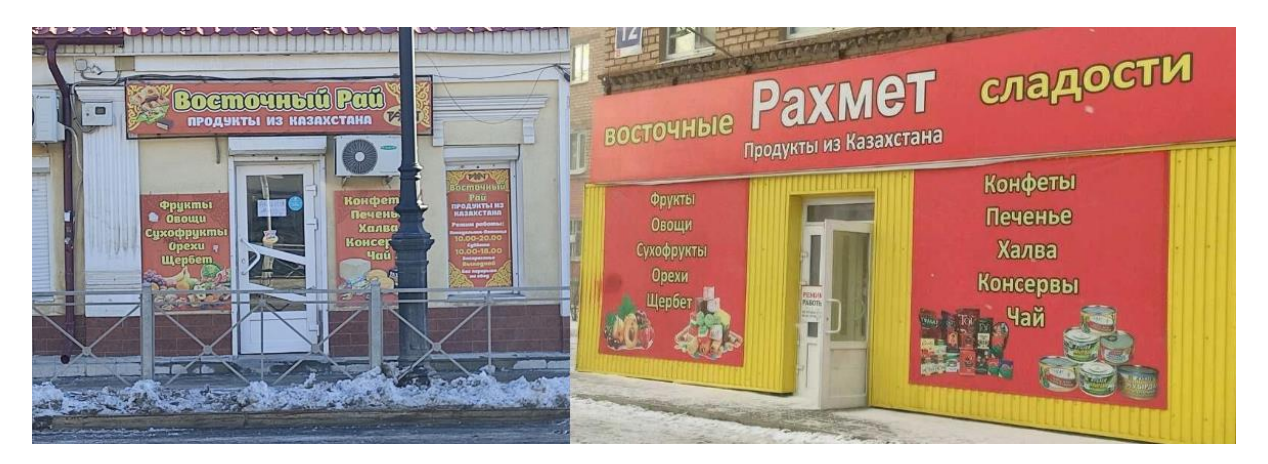
Figure 19. Kazakhstani food shops (Kuznetsov 2023)

The borderland element and references to Kazakhstan, are practically absent – only twice did we come across shops with sweets from Kazakhstan (Figure 19).