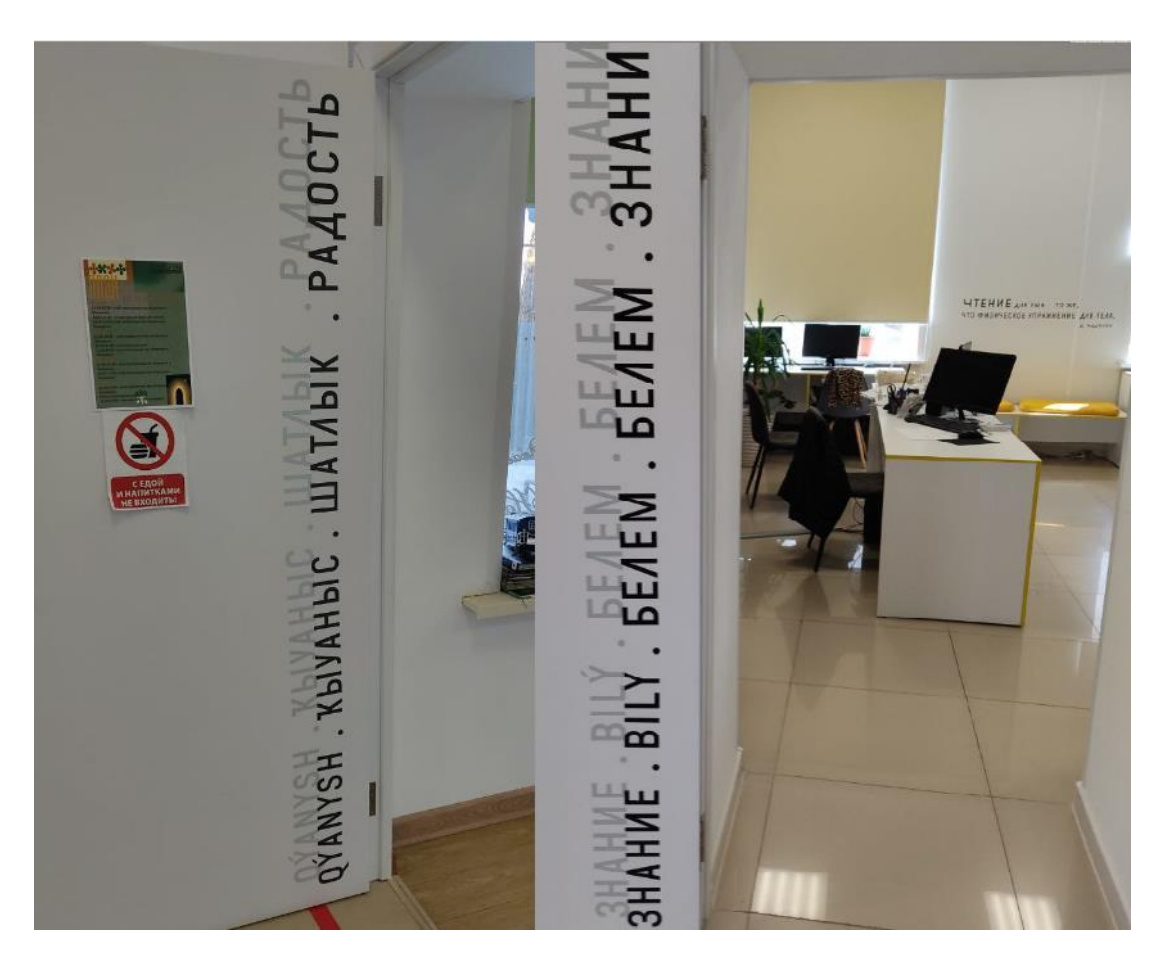
Figure 5. Kazakh, Bashkir, Tatar and Russian signs in the Tatar Library (Kuznetsov 2023)

There is a Library named after Kh. Yamashev (Библиотека им. X. Ямашева), also known as the "Tatar Library". As noted, it acts as a cultural and educational centre for the Tatar, Bashkir and Kazakh communities.