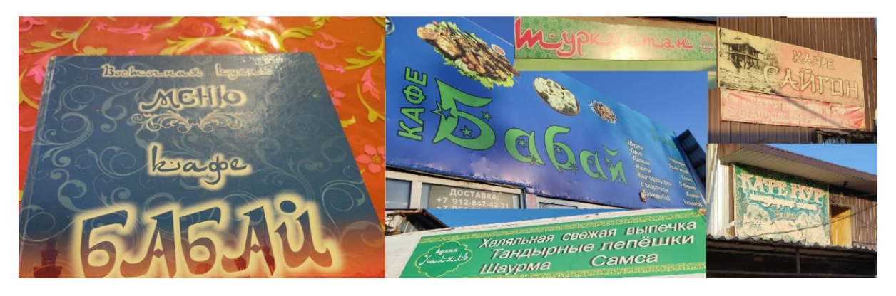
Figure 13. "Oriental" fonts in the designs of Asian and Eastern cuisine restaurants (Kuznetsov 2023)

In general, the linguistic landscape of the market is also almost entirely Russian. However, in ethnic cuisine restaurants, "oriental" font and style are actively used in the names and designs (Figure 13). The same can be seen in eateries near the mosque (Figure 14).