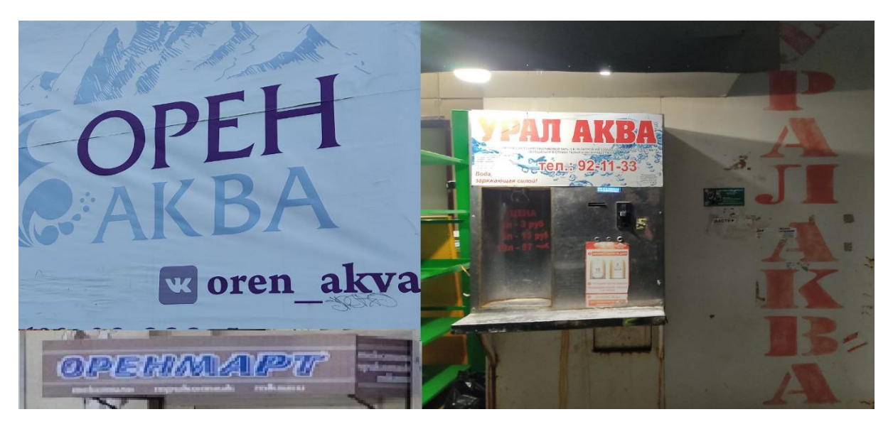
Figure 18.The use of local brand (Kuznetsov 2023)

The borderland element and references to Kazakhstan, are practically absent – only twice did we come across shops with sweets from Kazakhstan (Figure 19).