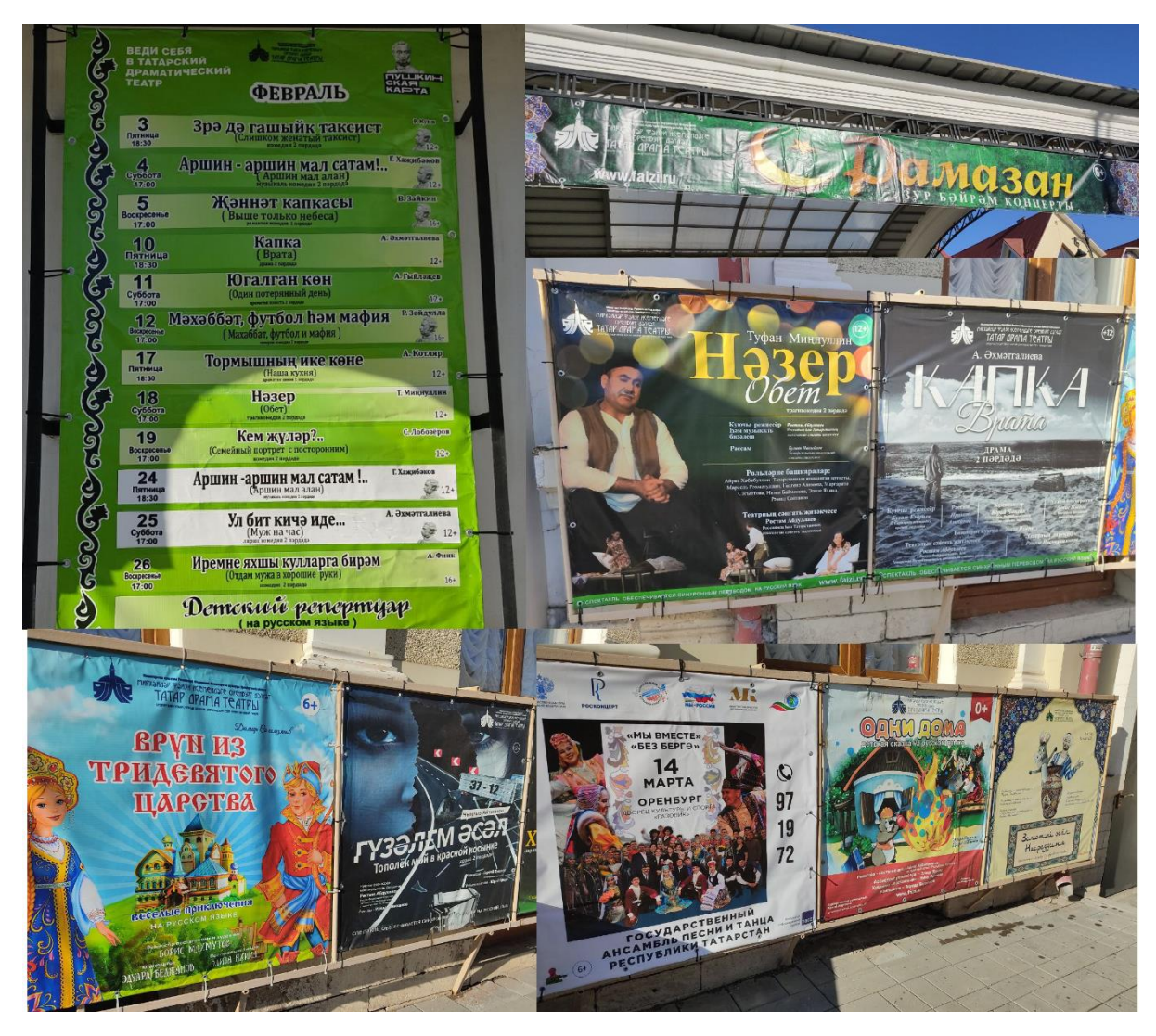
Figure 6. Tatar Theater posters (Kuznetsov 2023)

The city operates the Orenburg State Tatar Drama Theater named after. M. Fayzi (Татарский Драматический Театр им. Файзи), also known as the "Tatar Theatre". On its walls and nearby one can find perhaps the largest concentration of the Tatar language in the city – on posters (Figure 6).